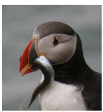
Figure: Sources of natural mortality include predation, disease etc.