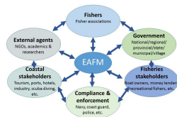
Figure : Potential stakeholders and their interaction within EAFM. Image was adapted from [? ].